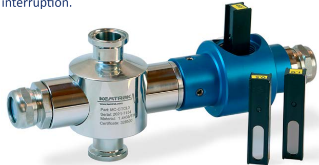
Integrated NIST validation accessory

The convenient range of small-footprint, zero dead-volume hygienic measurement cells that contain no electronics or moving parts are well suited for both ordinary and hazardous area installation. Standard NIST-traceable validation filters can be used to verify analyzer performance without process interruption.