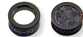
left: Optical filter used on a Kemtrak DCP007-UV photometer right: Eroded optical filter from a traditional hot mercury vapor lamp photometer

The proprietary dual wavelength, four channel measurement technique used in the DCP007-UV analyzer provides deep absorbance measurement to 5 AU using a 1 cm optical path-length. A range of shorter optical path-lengths allow for even deeper absorbance and optical density measurements.