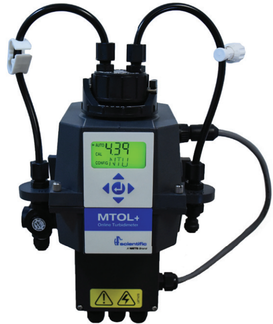
MTOL+ Online Process Turbidimeter Factory default 0 - 100 NTU